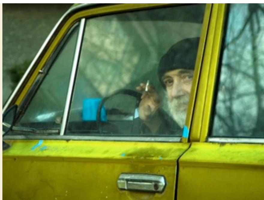
This project identified underlying causes that were significant in leading to long term homelessness.

Fourteen neuropsychological assessments have been completed. The results have been extremely useful in providing the best outcome for the clients. Various neurological and psychological diagnoses were made or confirmed, including