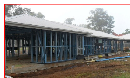
Pictured above are the homes under construction by Marist Youth Care's Affordable Housing for Life project. One home has already been built, providing secure accommodation for 4 young people, another home is due in a few weeks, and 2 more are currently under construction.